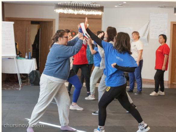
ESD Feature, Violence Prevention 5/14/23