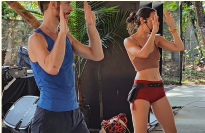
Teaching ESD 4/17/23